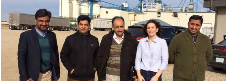
Delegation from Pakistan learning about our Quality Assurance managing to process lentils free of weeds seeds and dirt.

Pakistan is another country that is concerned about the poor quality they are receiving. A delegation from Pakistan recently visited our plant in Moose Jaw and were amazed at the precision of our quality assurance department and the shipment of red lentils leaving our plants cleaned with no soil or weed seeds. Our company is committed to processing, adding value and employing people in Moose Jaw and Swift Current area. We want to help brand Canada as a supplier of clean high quality red lentils.